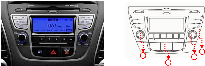
Fig11. Priority of applied texture on car console